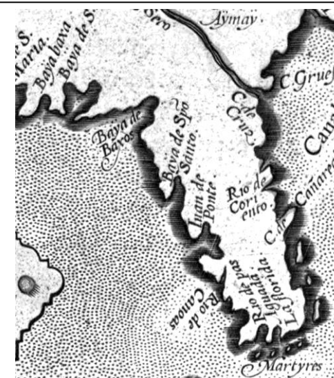
Left: a map done by a Spanish cartographer of the east coast of Florida in 1584.

Chairman of the Brevard County Historical Commission and works at the Florida Historical Society. He is currently researching a detailed history of the Cape Canaveral area from prehistoric times.