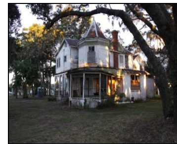
Southwest View of House