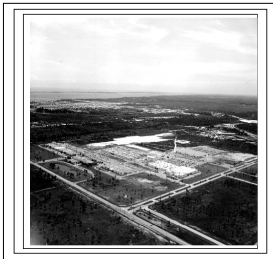
Radiation Inc. located in Palm Bay