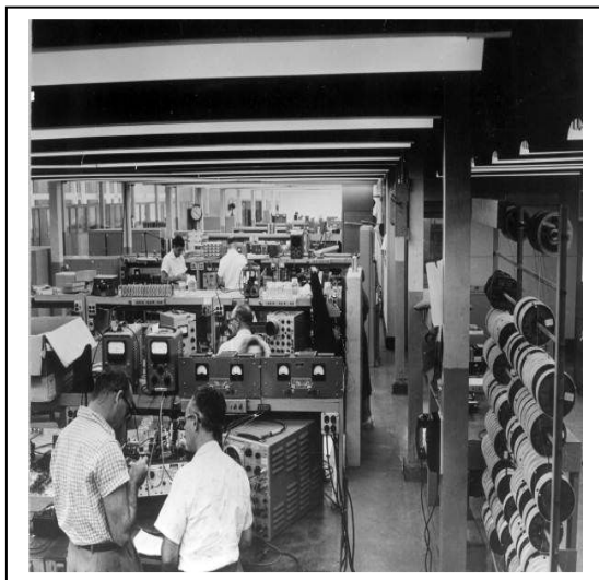
January 1958 - Laboratory at Radiation, Inc. in Melbourne