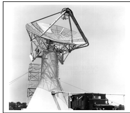
1950's 28 ' antenna built by Radiation, Inc.