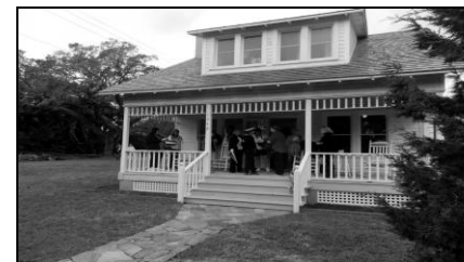
The Mitchell House