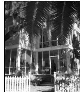
Old Eau Gallie Yacht Club