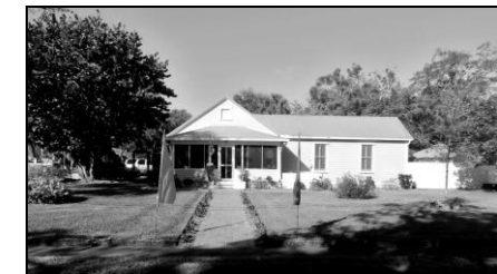
The Bennett House