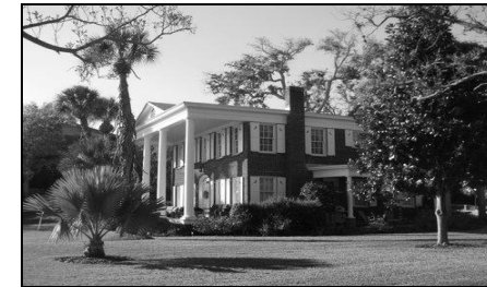
Historic William E. Horne House