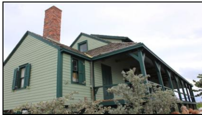
Gilbert's Bar House of Refuge, Hutchinson Island

As part of last month’s bus tour we visited Gilbert’s Bar House of Refuge and heard about a time in Florida’s past when the beaches were so remote sailors shipwrecked offshore surely would have died from exposure without these lifesaving “houses”. Looking down Melbourne’s beaches today it is hard to imagine such desolation ever existed. This illustrates the SBHS mission well; providing programs and trips that present the rich history of South Brevard specifically, and Florida generally, to the people who stop and take the time to look.