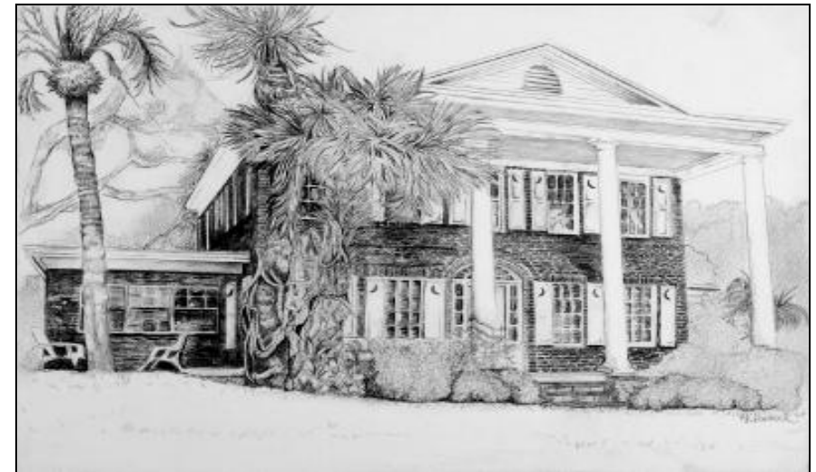
The Historic William E. Horne House