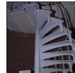
Staircase inside lighthouse