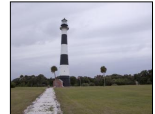
Walkway leading to lighthouse