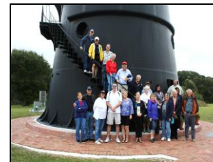
Group gathers at base of the lighthouse

November 22 nd proved to be a perfect day for the SBHS field trip to the Cape Canaveral Lighthouse. Over forty enthusiastic people gathered for this unique opportunity to explore up to the fourth level of this 167 foot tall structure. Docents from the Cape Canaveral Lighthouse Foundation met us at each level to tell about the history and detail of this historic site - the only operational lighthouse in the United States owned by the United States Air Force.