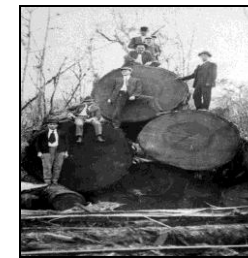
Giant cypress felled in 1917

Melbourne's Industrial Revolution is the subject of an educational exhibit at the Melbourne Library throughout the month of March. Using models, maps, vintage photographs and artifacts, historian Ed Vosatka shows the era of sawmills, iron horses and steam logging which transformed Melbourne from a quiet, rural village on Crane Creek into an industrial city.