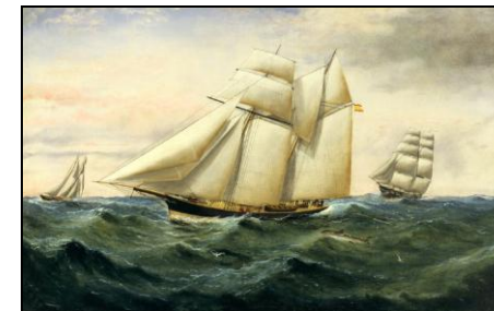
US Sloop Wanderer Ordered to investigate the Indian River, July 1862