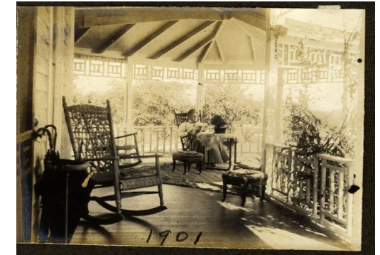
View from the front porch - 1901