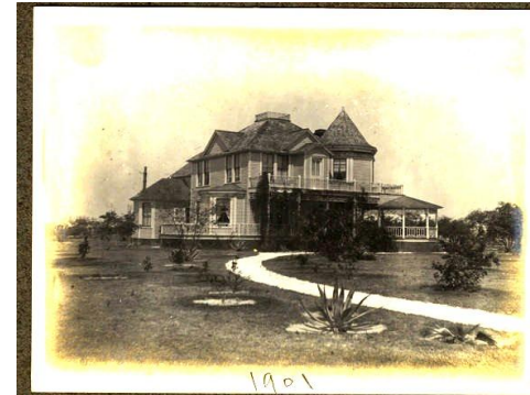
Green Gables - 1901

The Historic Preservation Code allows for eligible properties to be locally denoted as historic by the City of Melbourne. Properties that are selected are placed on the Melbourne Register of Historic Places. In order to obtain a designation, all property owners must first give their consent.