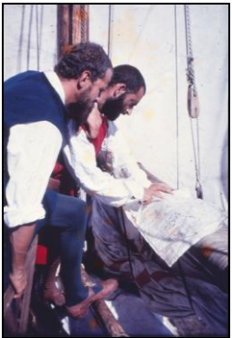
Viewing Columbus' Map

MELBOURNE PUBLIC LIBRARY 540 E. FEE AVENUE, MELBOURNE