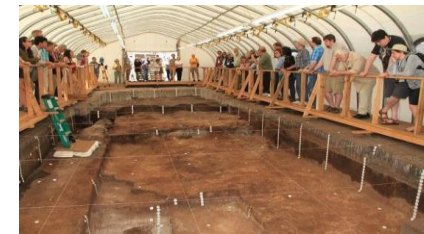
Old Vero Dig Site